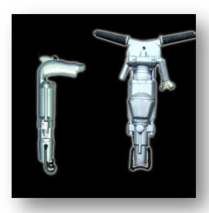
IR5JS - IR17/IR23