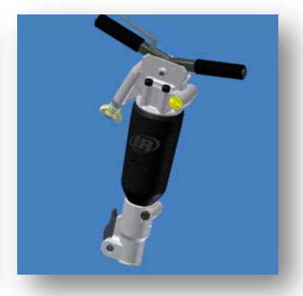
IR15BV - IR40BV