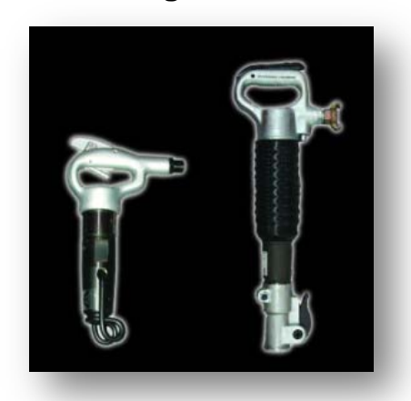
IR2PS - IR5PS IR9PS - IR12PV