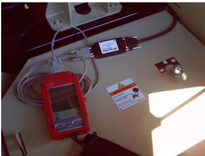
RS 232 serial cable connected

Connect the 15-pin connector from the proper engine cable to the 15-pin connector on the CAN adapter as shown below.