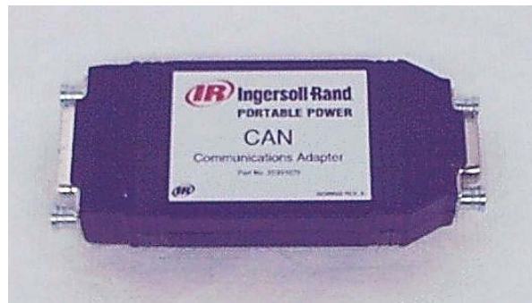
CAN Communications Adapter

Connect one of the 9-pin connectors on the RS232 cable to the 9-pin connector on the CAN adapter. Connect the other 9-pin connector to the 9-pin connector on the VIRTUAL TECHNICIAN as shown below.