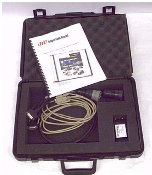
CAN COMMUNICATIONS ADAPTER KIT

The CAN COMMUNICATIONS ADAPTER kit contains the protocol adapter, Cummins, I-R engine cable, CAT engine cable, RS232 cable, CD with software and manual. If any of these items are missing, contact Ingersoll Rand Customer Support at 800-633-5206 to get the missing components. The picture below shows the contents of the kit.