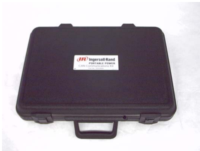
CAN COMMUNICATIONS ADAPTER KIT

The engines broadcast various messages, at specific intervals, across the J1939 network. These messages include real time engine parameters such as oil pressure, intake manifold temperature and RPM. Also included, are engine fault codes that signify problems that have occurred. The VIRTUAL TECHNICIAN allows the service technician to view these parameters and fault codes. In conjunction with the appropriate service information, the VIRTUAL TECHNICIAN can be used to troubleshoot engine problems and make necessary repairs.