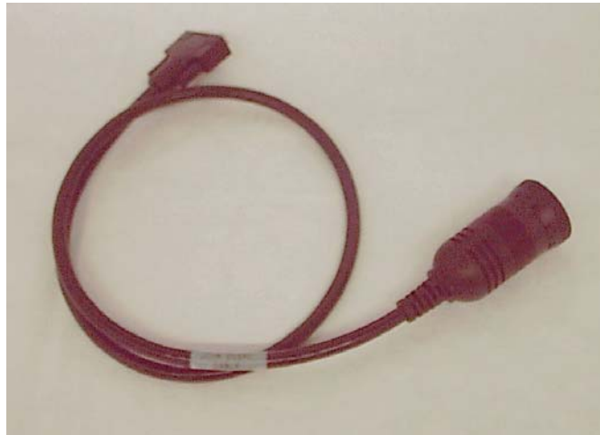
Cummins/I-R Engine Cable

P/N 22391064 cable connects to the Cummins and I-R engines and is shown below.