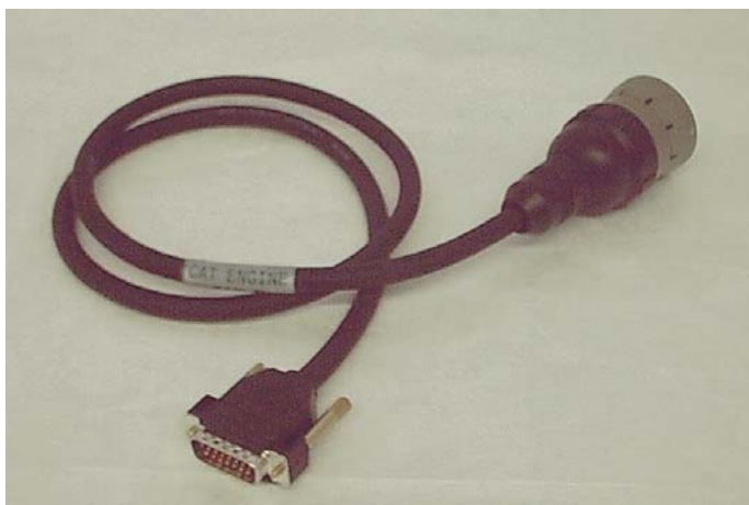
CAT Engine Cable

As describe previously, the CAN Communications Adapter Kit is designed to work with three engines: Cummins, CAT and I-R. There are two cables supplied in the kit to connect the these engines. P/N 22391106 cable connects to the CAT engine and is shown below.