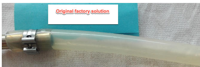
[Figure 3] Full length steel pipe